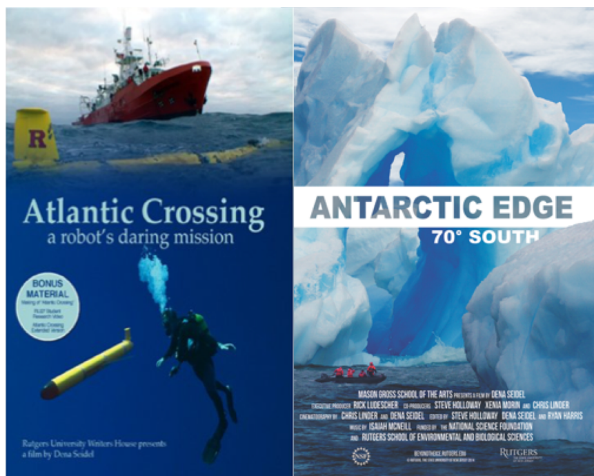
Figure 2. Two feature length movies developed, edited and scored by Rutgers undergraduates drawn from English, Music, and Art Departments. These nationally broadcast films became a unique means to entrain non-science students in telling science stories.

produced and edited a documentary, Atlantic Crossing: A Robot's Daring Journey , that went on to win accolades at dozens of film festivals and was broadcast nationally on the Public Broadcasting Service. This was followed with another film where undergraduate art and music students edited several thousand hours of footage and music students wrote an original score to produce a second film, Antarctic Edge: 70 Degrees South , that went on to win >10 awards at international film festivals. These efforts provided an effective outreach tool and provided a positive message with which to increase recruitment into the sciences and engineering. The added advantage was science faculty, in order to entrain the Art-English-Music students, lectured in those Departments which increased overall science literacy and provided context for the student-driven creative efforts. These non-science students went on to often being very engaged in promoting the science message. A common theme we discovered it was not the science that was the “hook”, it was the robots. Robots were the gateway drug to entrain students to then take interest in learning about the science.