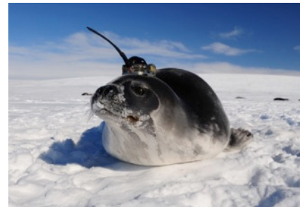
Figure 1 : Weddell seal carrying a CTD-SRDL instrument that collects temperature and salinity profiles while the animal is at sea.

Marine mammals help gather information on some of the harshest environments on the planet, through the use of miniaturized ocean sensors glued on their fur. Since 2004, hundreds of diving marine animals, mainly Antarctic and Arctic seals, have been fitted with a new generation of Argos tags developed by the Sea Mammal Research Unit of the University of St Andrews in Scotland, UK. These tags investigate the at-sea ecology of these animals while simultaneously collecting valuable oceanographic data. Some of the study species travel thousands of kilometres continuously diving to great depths (up to 2100 m). The resulting data are now freely available to the global scientific community at http://www.meop.net . Despite great progress in their reliability and data accuracy, the current generation of loggers while approaching standard ARGO quality specifications have yet to match them. Yet, improvements are underway; they involve updating the technology, implementing a more systematic phase of calibration and taking benefit of the recently acquired knowledge on the dynamical response of sensors. Together these efforts are rapidly transforming animal tagging into one of the most important sources of oceanographic data in polar regions and in many coastal areas.