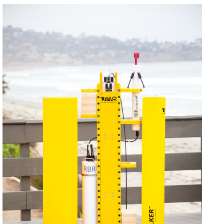
Figure 5 Wirewalker including RBRconcerto CTD with DO and turbidity, also RBRfermata battery canister

The figures from the WEBB floats suggest that the SBE-41cp requires approximately 3.5kJ to perform a nominal 2000dbar profile, whilst the RBR requires 0.7kJ. This lowered contribution to the overall energy budget of the float results in an increased number of profiles during the lifetime of the platform.