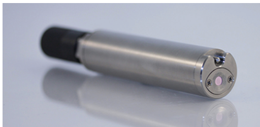
Figure 2 RBRcoda ODO oxygen optode. \phi 28\text{mm} , integrated \pm 2\text{mK} accuracy thermistor

In addition to our standard RBR argo 2000m CTD, recent work on a 6000m CTD has produced results that will be presented to the ARGO steering team in March 2017. Deployment by Uchida et al from the R/V Kairei in January 2017 to 3000m, 5000m, and 6000m has produced some exciting data. Both the Deep APEX and Deep SOLO (glass sphere floats) will be amenable to a side-by-side comparison between multiple CTDs, and we are actively seeking partners for further evaluation.