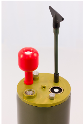
Figure 3 MRV ALAMO float with RBR CTD+PAR

A variety of platforms have incorporated RBR sensor packages, including Teledyne Webb APEX floats, MRV ALAMO floats, MetOcean telematics NOVA floats, Wirewalker profilers, and others.