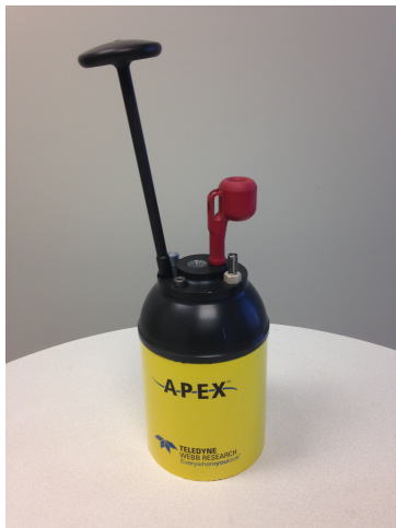
Figure 4 Webb APEX float with RBRargo CTD

The ARGO program in particular has shown great interest in having a low power CTD that, while preserving the measurement goals of the platform, increases the autonomy of the float.