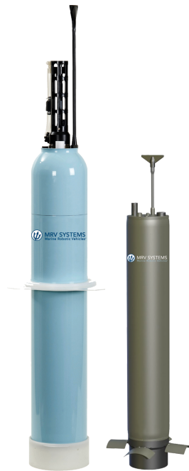
Figure 1. The MRV S2-A profiling float (L), with SBE-41CP CTD and MRV GPS-Iridium antenna. The MRV ALAMO “A-size” profiling float (R), with RBR temperature-pressure sensors and MRV GPS-Iridium antenna.

GPS and Iridium antenna. The S2-A has 650cc of displacement change; dV/V = 3.4\% . The S2-A with a full load of Lithium primary batteries is capable of 325 profiles to 2000m. The MRV S2-A is shown in Figure 1.