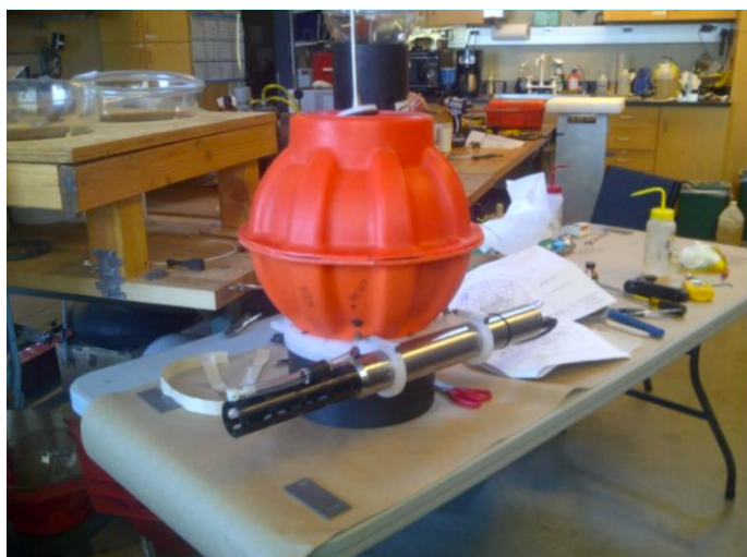
Figure 4. Deep SOLO in IDG lab at SIO.

MRV has personnel trained at SIO in the production of the Deep SOLO, and is in the final phases of negotiation with the launch customer. We anticipate establishing full production of the Deep SOLO during 2017.